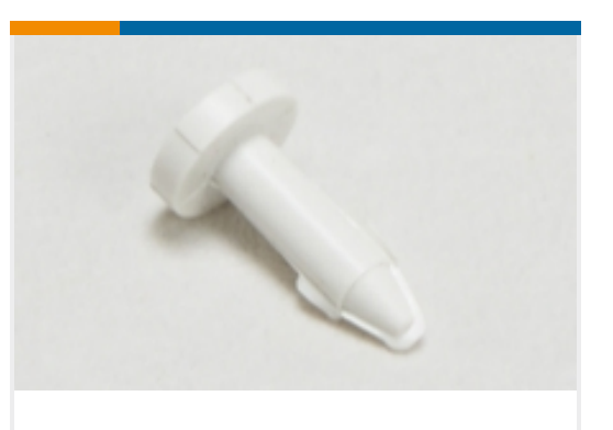
D-Sub Contact Accessories(1)