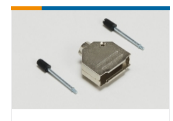
D-Sub Backshells & Clamps(135)